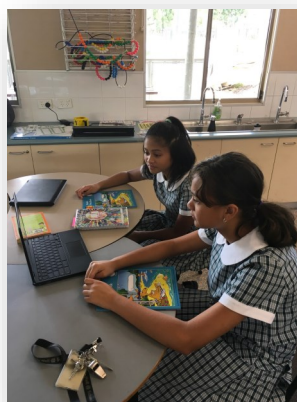
Year 6 using Understanding Faith website to assist their learning