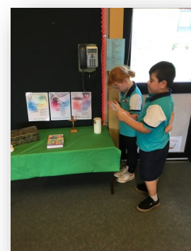
Year 1 were setting up their prayer space