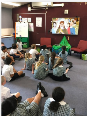
Year 5 learning about the Parables Jesus shared with us.