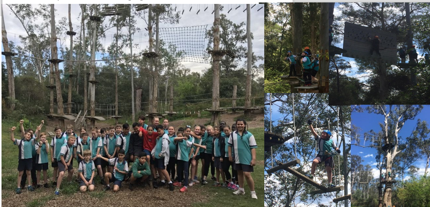
Holy Family Primary School, Emerton