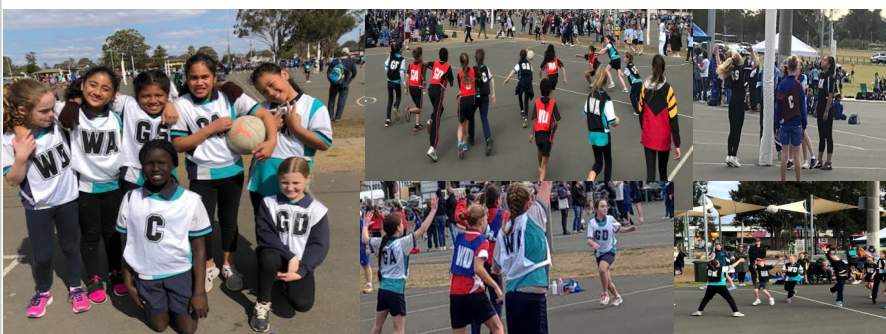
Holy Family Primary School, Emerton